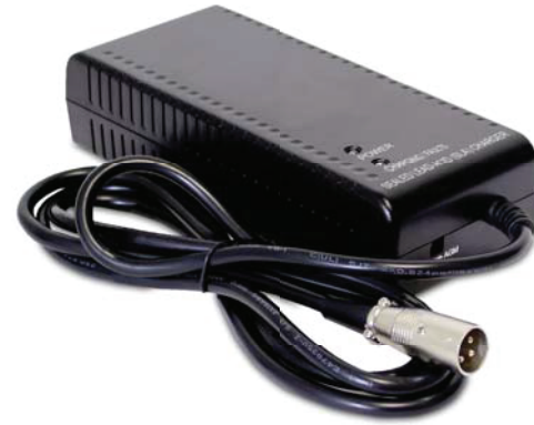
Due to continuous improvements to our products, product may vary slightly from depiction.