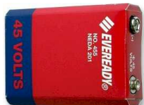
Industry Standard Dimensions in mm (inches)